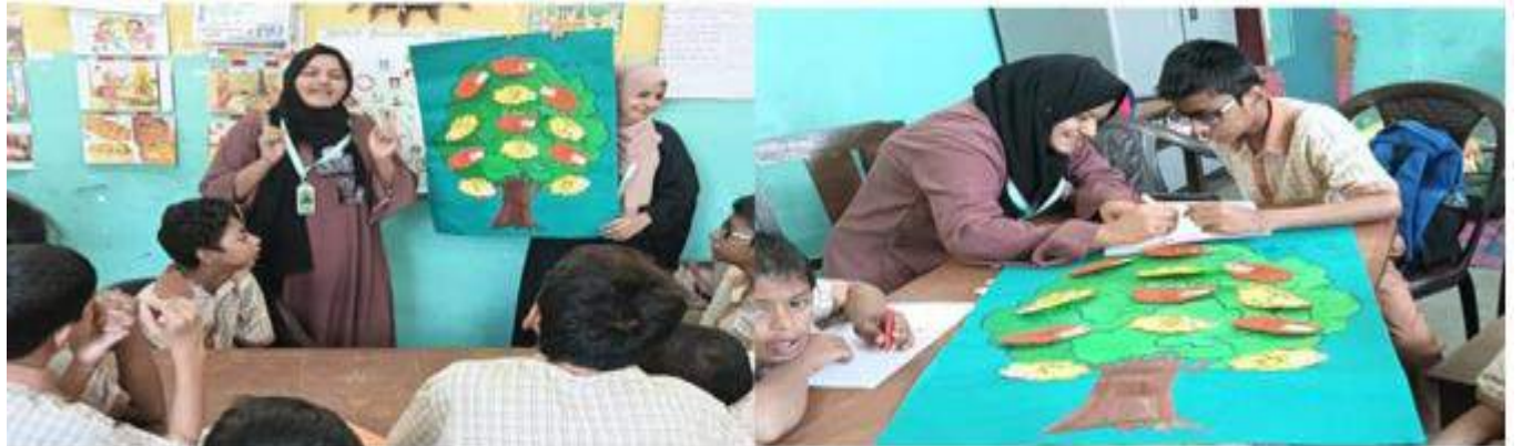
Hindi alphabets Making puzzle