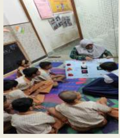
Group 12: Names of Flowers, Fruits, and Vegetables, Shapes and Measurement. ACTIVITY- Collage, Pot painting