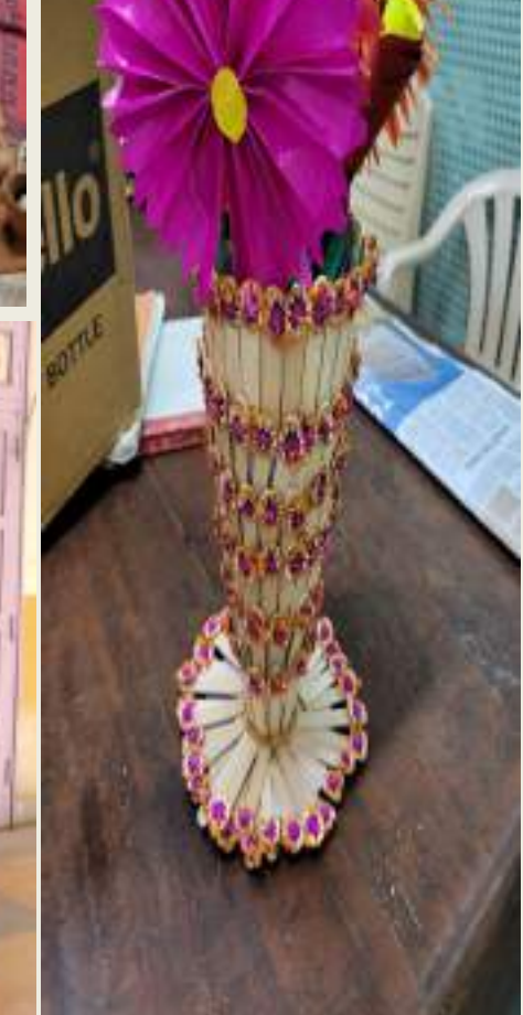
Group 11: Add, Subtract, Parts of Tree, Parts of Body, ACTIVITY- Paper Bag, Block Painting and Ice-cream stick Bouquet.